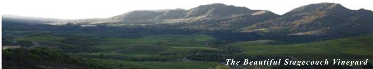
The Beautiful Stagecoach Vineyard